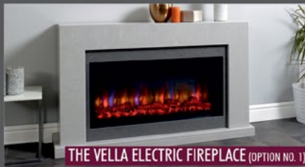
THE VELLA ELECTRIC FIREPLACE (OPTION NO. 1)