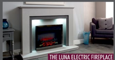
THE LUNA ELECTRIC FIREPLACE