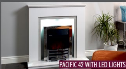
PACIFIC 42 WITH LED LIGHTS