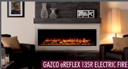
GAZCO eREFLEX 135R ELECTRIC FIRE