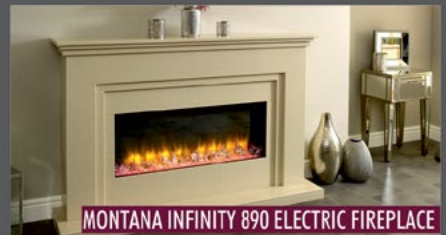
MONTANA INFINITY 890 ELECTRIC FIREPLACE