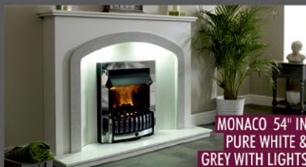
MONACO 54" IN PURE WHITE & GREY WITH LIGHTS