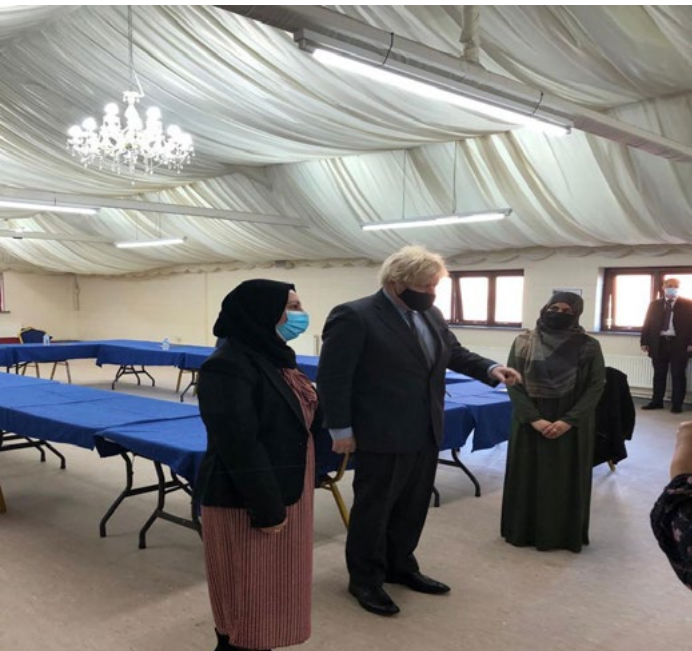
Boris Johnson with IMWS women members